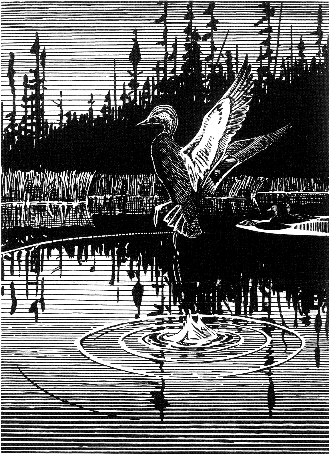
Illustration is by permission – in new Tufts Birds of Nova Scotia